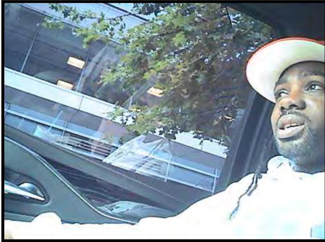
(WHITE in CHS 1's car.)

67. On August 9, 2024, WHITE responded: “Can you do half?” which CHS 1 understood to mean that WHITE was asking for $5,000, as CHS 1 had previously paid $10,000 to WHITE. CHS 1 agreed to give WHITE $5,000.