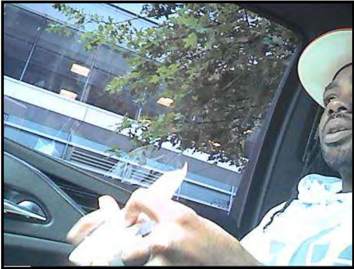
(WHITE receiving an envelope containing the $5,000 payment.)

71. CHS 1 and WHITE then discussed WHITE's efforts to use his position as a Councilmember to pressure employees of DYRS to approve Company 2's contract for the "Credible Messenger" program: