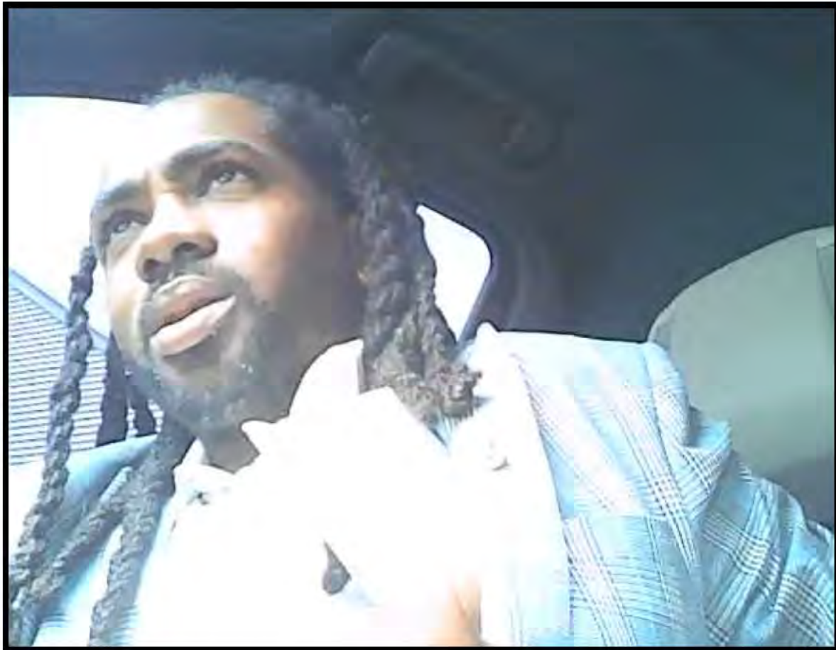
(WHITE putting an envelope containing the $10,000 payment into his jacket pocket.)

63. WHITE then said: "We in a good place with the ONSE, but I want to make sure that we cross the finish line and get to what we want to get with this . . . ." WHITE added: "I think that I got to massage it a little bit more and I got. I got an inside person that I am working with on..." At that point, CHS 1 handed WHITE an envelope containing the $10,000 he had previously requested.