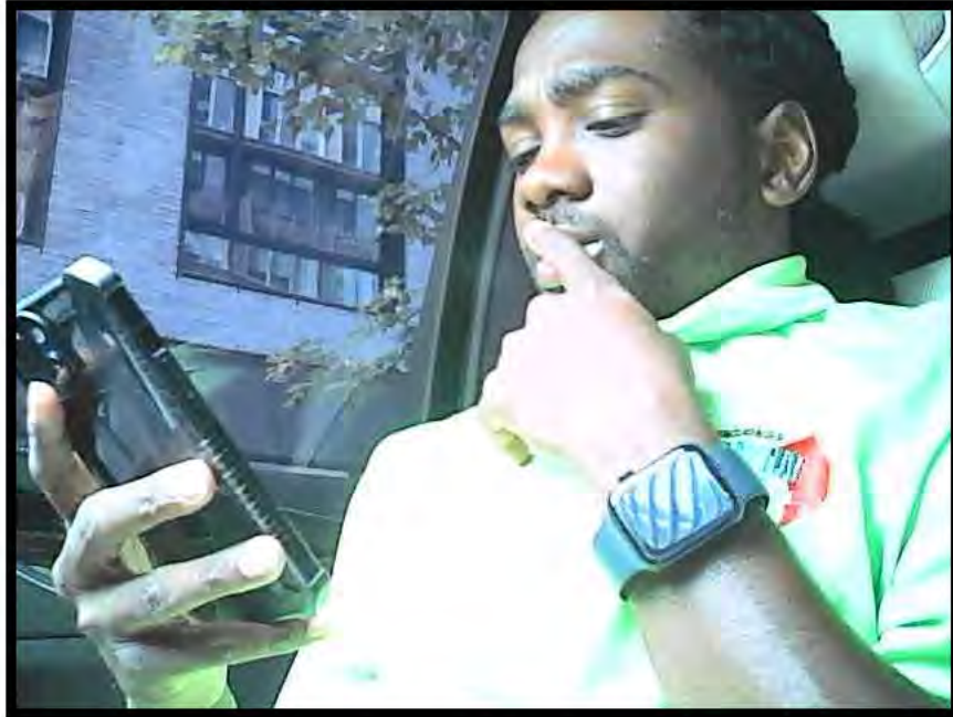
(WHITE in CHS 1's car.)

40. WHITE updated CHS 1 on his efforts to pressure the ONS and DYRS to extend their grants to Company 1 and Company 2. CHS 1 offered and White agreed to accept a kickback of 3% of each grant's value in exchange for WHITE's assistance in this regard.