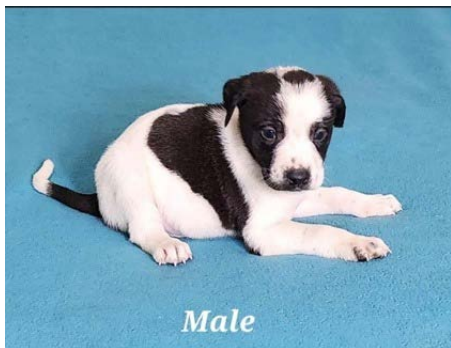
Male, 2 month