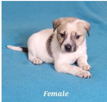
Female, 2 months